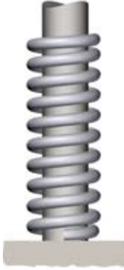
2. Not ground with internal location