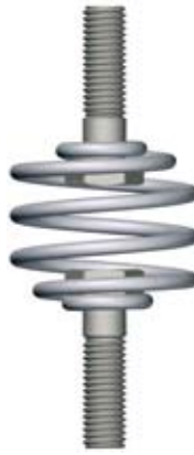
8. Loops with bolt mounting