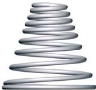
7. Conical compression spring gives a progressive spring characteristic