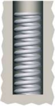
1. Ground with external location