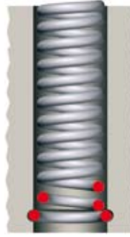
4. Enlarged end coil for mounting in groove