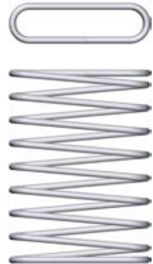
9. Rectangularly wound compression spring (magazine spring)